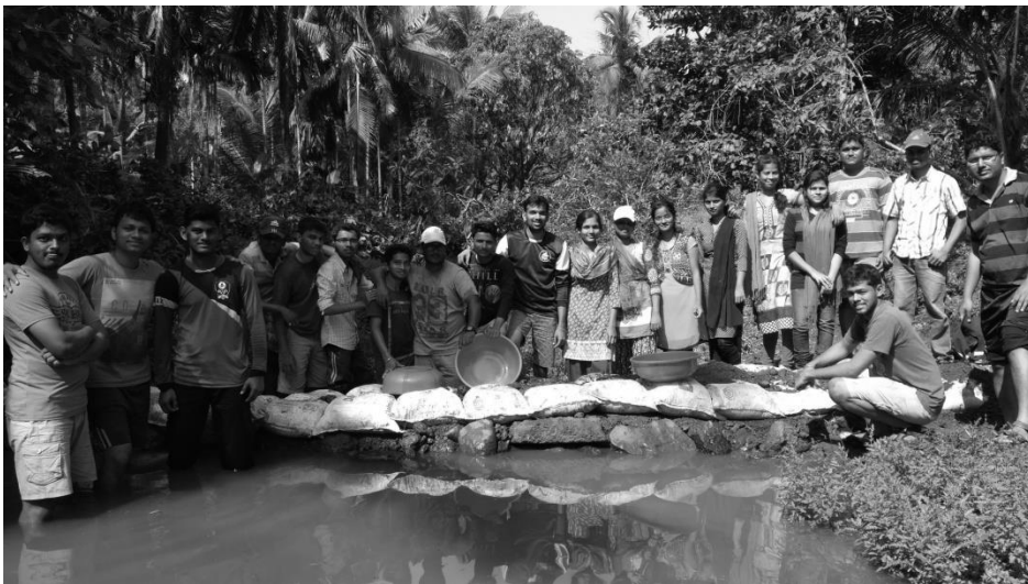
Volunteers after construction of Dam (Vanarai Bandhara)