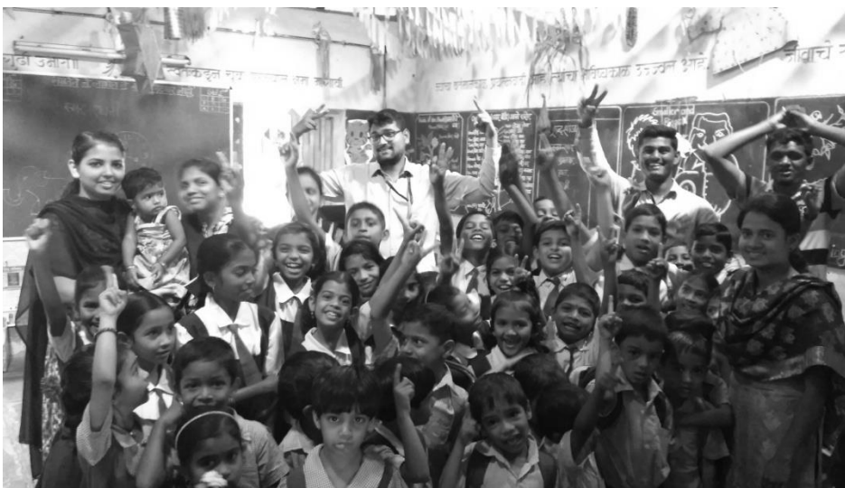
Volunteers with school students