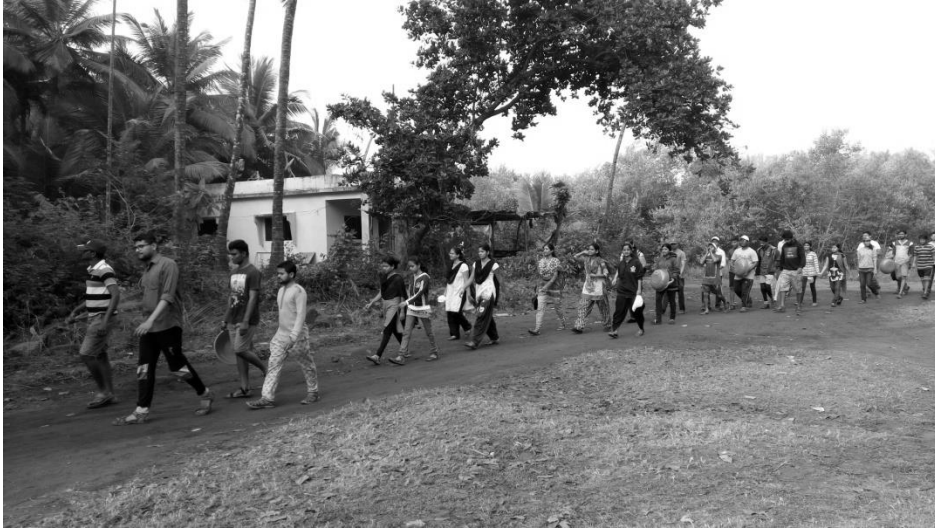
Volunteers during Awareness rally